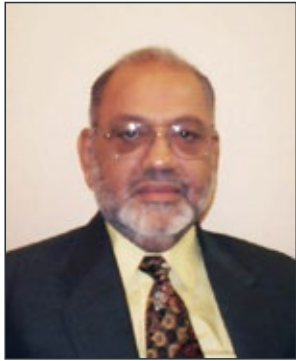
The Editor, Parsi Junction.