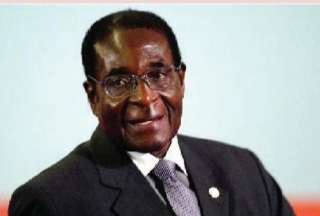
Zimbabwe's ex-President Robert Mugabe

“ If you are ugly means, you are ugly. Stop talking about inner beauty because people don't walk around with X-ray machines to see inner beauty. ”