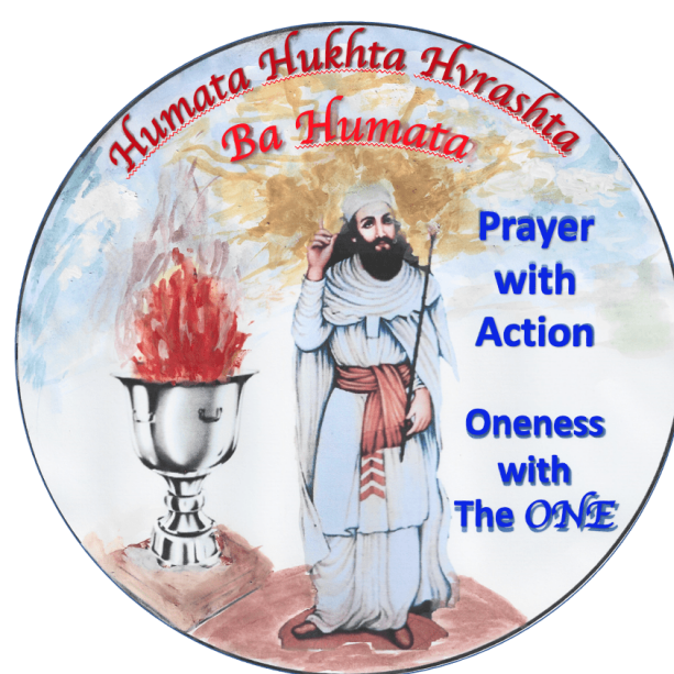
Ba Humata Flame of Fellowship of Collective Consciousness

Please join us on Sunday 22 August 2021 in the Ba Humata Webinar series for a Special Webinar to celebrate Khordaad Saal