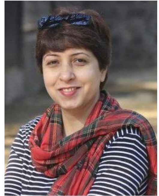
Ruby B. Aderbad

The "Tano Bora" which means the "Magnificent 5" is a coalition of five male cheetahs that have captured the hearts and lenses of many who have gone to Masai Mara, Kenya. Usually once they reach adulthood, male cheetahs will become solitary or at times join another to form a pair. It is very rare to see a group this large bonding together. Here they are sitting on a vantage point on a sultry evening in Masai Mara looking for potential prey.