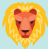
Leo (Simha Raashi-m tt)

With regards to your love life things are looking good. For a few of you discussions of marriage are on the cards. Careerwise also this week is good. Opportunities will arise. Overall a good week especially financially.