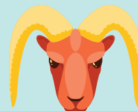
Capricorn (Makar Raashi-kh j)

Arguments and misunderstandings are seen with a loved one. Try your best to avoid these minor disputes. Careerwise you will be provided with a choice. This could be two options between two jobs or two career paths as well. Overall it's a week which promises romance and love.