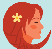
Virgo (Kanya Raashi-p tthh)

A few minor disputes are seen with a loved one. Do not let ego come in the way. Careerwise this is an excellent week. Chances of a raise or promotion as seen. A week filled with love and support of family as well.