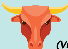
Taurus (Vrishabh Raashi-b v u)

Sudden transformation and endings are seen on a personal front. Long lasting relationships that were not serving a purpose will come to an end. Careerwise new opportunities are on the horizon. And overall this week promises good financial returns so it's an excellent week for investing.