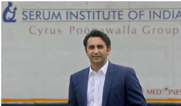
Adar Poonawalla , chief executive of the Serum Institute of India, on vaccines, regulation and what comes next

Adar Poonawalla, 40, is the chief executive of the Serum Institute of India (SII), the Pune-based, family-owned vaccine manufacturer that is producing more Covid-19 vaccines by dose than any other in the world. For now it's the Oxford/AstraZeneca vaccine rolling off its production lines, but SII has signed contracts with three other developers – Novavax, Codagenix and SpyBiotech – all of which have candidates in the works.