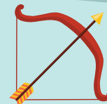
Sagittarius (Dhanu Raashi-bh f dh)

For those of you who were experiencing heartbreak things look much better as positive growth and movement is seen in your love life. Career wise for those exploring creative pursuits it's a good week. Overall it's a time of planning and laying down foundation for the future.