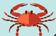
Cancer (Karaka Raashi-dd h)

A tough week overall. You will try to work towards clarity and communication with regards to your love life. Career wise it is best that you lay low and do not make any decisions. A week that will bring in certain energies that will require you to sacrifice for a higher cause.