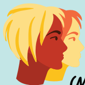
Gemini (Mithun Raashi-k chh gha)

Heartbreak or sadness looms on the horizon with regards to your love life. Careerwise it's a good week as abundance will follow you. It is a good week to manifest your wishes as that energy is available for you so remember to make a wish that you actually would like when it manifested.