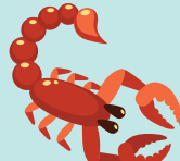
Scorpio (Vrishchik Raashi-n y)

A sudden chance encounter or a sudden turn of luck is seen with regards to your love life. Even careerwise a good name and accolades are seen. The advice for you is to leave behind toxic situations as changes will bring about good things.