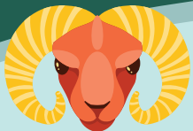
Aries (Mesh Raashi-a l e)

With regards to your love life things are looking good. For a few of you discussions of marriage are on the cards. Careerwise also this week is good. Opportunities will arise. Overall a good week especially financially.