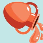
Aquarius (Kumbha Raashi-g s sh)

Things on the personal front look a bit tough. You could be feeling dominated or not being heard. Careerwise it's a great week for those looking out for a new job this is a good week for that. Overall this week will bring in a lot of changes and sudden transformations which will always work out for the better.