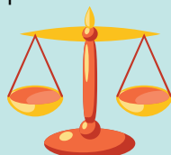
Libra (Tula raashi-r t)

Things will improve if they were low with regards to your love life. Moderation is the key word for you. Careerwise planning and laying down foundations is seen this week. Overall it's a time of honing your skills and you will see that you will receive appreciation from others as well.